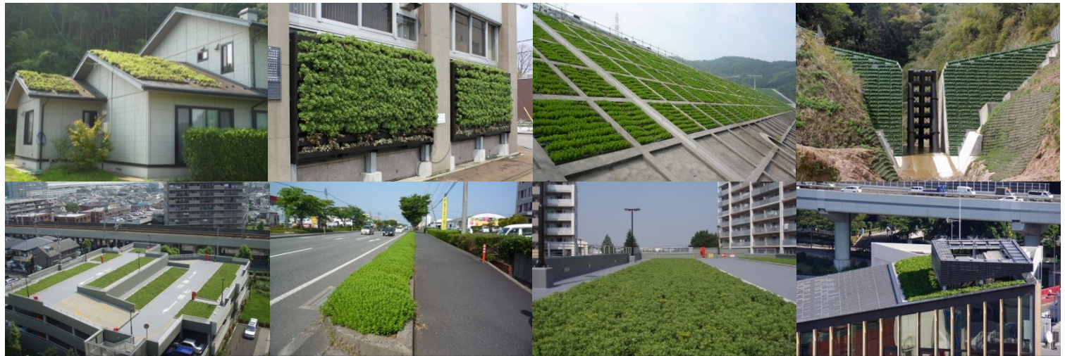
Kirinsou active in a variety of locations. (Rooftop, Wall, Concrete slope, Dam, Road, Freeway, Others)