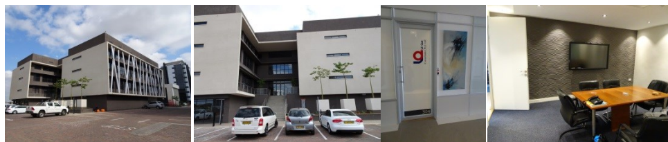
Suite4,third floor Central Square Lot 54354 New CBD Gaborone